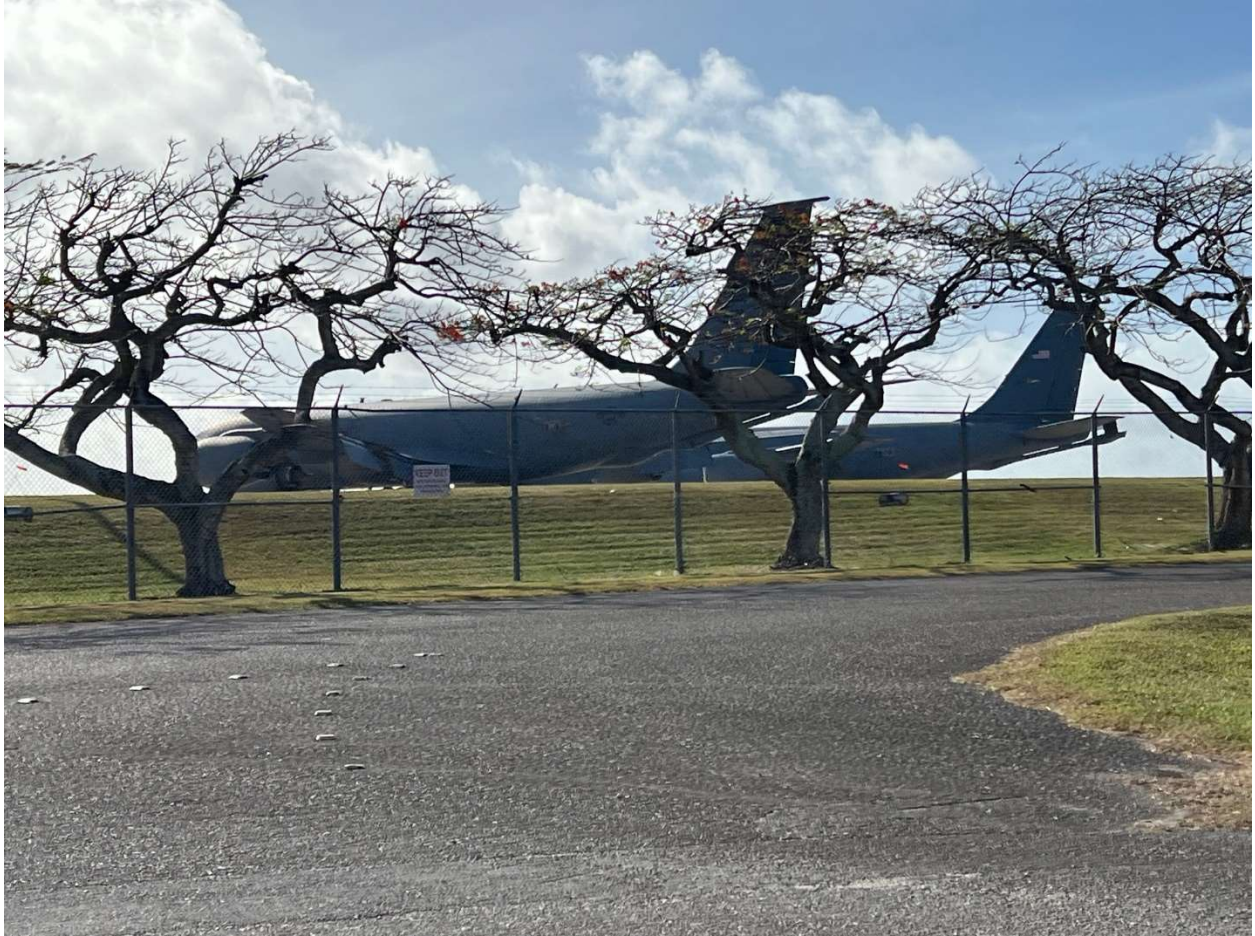
Photo: US Air Force KC-135 at the Francisco C. Ada/Saipan International Airport, February 10, 2024.